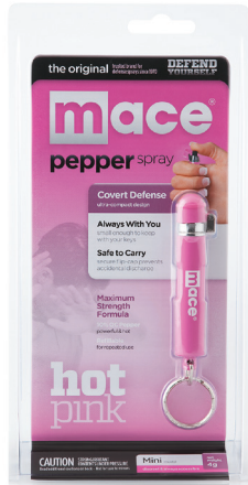
80365 • $18.95 Pink

Attractive MACE® PEPPER SPRAY HARD CASE MODELS fit easily in a pocket or purse. Features glow-in-the-dark locking safety cap and key ring, 11 gram stream unit sprays up to 10 feet. Contains 5 one-second bursts. Available in four fashionable colors. Includes key ring.