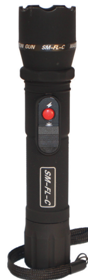
SM-FL-C • $35.00

is a great addition to your arsenal for self defense. The hidden probes make it look like it is just an ordinary flashlight. If given the chance this ordinary looking flashlight will light you up and will pump 9 million volts right into any attacker. It is rechargeable in two different ways. It can be charged with the supplied wall charger and a cigarette lighter adaptor so it can be charged on the go. It comes with a standard wrist strap and has a rubberized coating to help secure a firm grip.