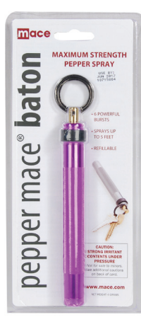
80335 • $35.95 Purple 5¾" x ¾"