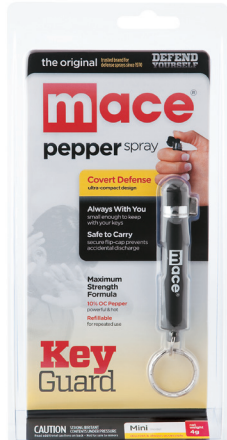
80366 • $18.95 Black