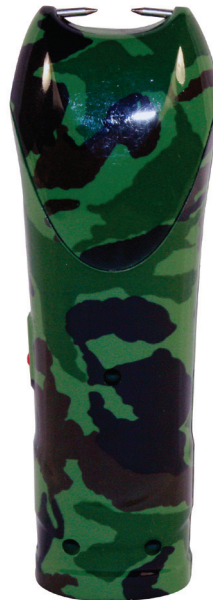
SM-FLR-CM • $22.95 Camo Print