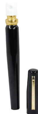
PS-3 • $9.95

Contains 6-10 one-second bursts & range of 6-8 ft.