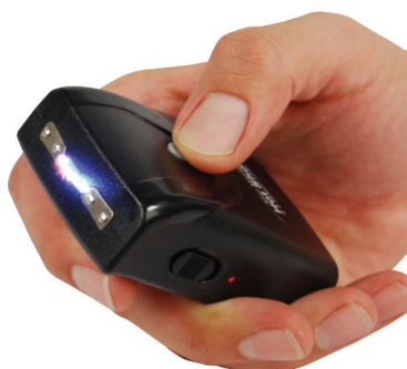
SM-HS • $64.95 2¼" x 2" x 1½"

The KNUCKLE BLASTER STUN GUN is a 950,000 volt stun gun designed to give you a punch with power. Just touch your attacker to instantly repel them and it will give you time to get away. Longer contact will cause further disorientation and after some seconds may drop them to their knees. Uses 2 Lithium batteries (included FREE). Comes with a free nylon belt holster ($15.00 value) designed to allow quick access and deployment of this amazing stun weapon. This patented device has a soft rubber skin and is sized to accommodate all hand sizes. A safety switch is built in and accessible to your thumb. Once you grab the Knuckle Blaster stun gun you can flip off the safety and fire with the same hand. No need to use two hands. One year warranty.