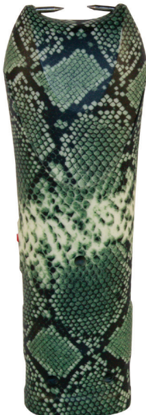
SM-FLR-SN • $22.95 Snake Skin Print