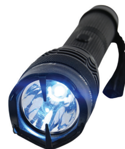
SM-MINIBADASS • $25.95 14 ¾" x 1 ½"

The STUN MASTER® 15 MILLION VOLT MINI BADASS FLASH-LIGHT STUN GUN is made of high quality aircraft aluminum and delivers a shocking blow when used as a stun gun, flashlight, or baton. You can carry 15,000,000 volts of stopping power almost anywhere with no one even knowing because the stun gun is concealed in the flashlight. Light up any attacker and leave them wishing they had never approached you. It measures 9 3/8" x 1 7/8" and has a lifetime warranty.