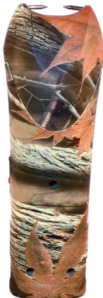
SM-FLR-WD • $22.95 Woods Print