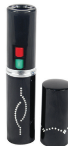
SM-LIPSTICK-B $22.95 Black

The STUN MASTER® 3 MILLION VOLT RECHARGEABLE LIP-STICK STUN GUN with FLASHLIGHT is secretly disguised in a decorative tube of lipstick. Its innovative design Takes it one of the coolest things we have added to our product line in recent years. Its small size makes this stun gun unique and super portable. It's only 5" tall, and whether you're carrying an oversized purse or an evening clutch, this stun gun goes wherever you go...for your safety, convenience, and peace of mind. This little beauty is powered by a built-in rechargeable battery and includes a power cord. Under the cap there are 2 buttons: one for the bright flashlight and one for the stun gun. The compact dimensions are 5" x 1" and this baby will really surprise the heck out of the poor slob who messes with the lady carrying this. Available in 3 colors Black, Pink, and Purple.