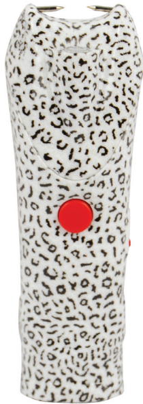
SM-FLR-AP • $22.95 Animal Print