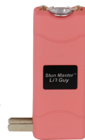
SM-LILGUY-P $24.95 Pink

The STUN MASTER® L'IL GUY 7.5 MILLION VOLT STUN GUN WITH FLASHLIGHT and Nylon Holster Black This little stun gun is small and compact. It has a super bright LED flashlight built in charger and comes with a nylon case. It measures only 3 3/4" x 1 1/2" x 3/4". Don't let the name Stun Master Lil Guy fool you. It has a beast inside just waiting to be released. Just press the shock button and the Lil Guy thrashes 7,500,000 volts out of the metal probes. The safety switch is off when in the down position, middle position is the super bright LED flashlight, and in the up position the shock is turned on once the trigger is pressed. Available in 3 colors Black, Pink, and Purple. Size: 3 3/4" x 1 1/2" x 3/4"