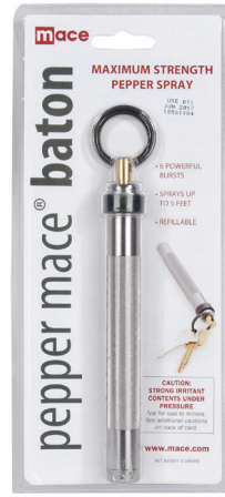
80335 • $35.95 Pewter 5¾" x ¾"