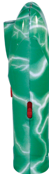
SM-FLR-GL • $22.95 Green Lightning Print