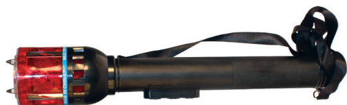
FL-LG • $41.95

The new and improved MULTIPURPOSE 10 MILLION VOLT STUN ALARM FLASHLIGHT is rechargeable and has led bulbs in the flashlight. It features a stun gun function, 150 db alarm with steady red light, bright led flash light, led red flash light, led red flashing light for signaling, and shoulder strap. This is a great item for police, security, and for self defense. Length 15.5", flashlight 2.75", handle 1.5"