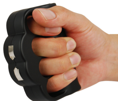
ZAPBK950 • $69.95 45/16" x 3¼" x 1½"