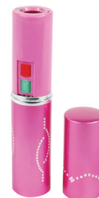
SM-LIPSTICK-P $22.95 Pink