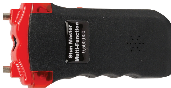
SM-MULTI • $59.95 4¾" x 2½" x 1"

The STUN MASTER® MULTIFUNCTION rechargeable stun gun features 9.5 million volts, a super bright LED flashlight, red flashing emergency lights, alarm and disable pin wrist strap. Comes with a Nylon Holster. 4¾" x 2½" x 1"