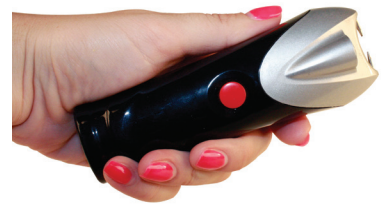
SM-FLR-GB • $22.95 5 1/8" x 1 3/8" x 1 1/8" Gray and Black

The STUN MASTER® 8.5 MILLION VOLT RECHARGEABLE FASHION STUN GUN with FLASHLIGHT is an ultra thin stun gun with a mean bite. It's about the size of a small electric shaver and comfortably fits in small hands. The safety switch is located on the side of the stun gun and has three positions: off, flashlight only, and stun gun only. The activating switch is the round, red button just below the flashlight. This stun gun has a built-in nickel-cadmium rechargeable battery and comes with an easy to use integrated charger. Simply plug the charger into the stun gun and then into an electrical outlet. The LED charge light will turn on. The Stun gun may have a small charge when it arrives but you will need to charge it for 12 hours. The flashlight is 60 lumens. After the initial charge and long periods of inactivity we recommend recharging the stun gun for 2 hours. Size: 5 1/8" x 1 3/8" x 1 1/8".