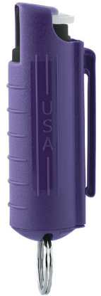
80392 • $14.95 Purple