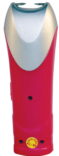
SM-FLR-GP • $22.95 Gray and Pink