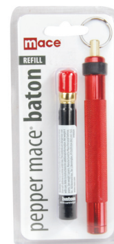
80361 • $7.95