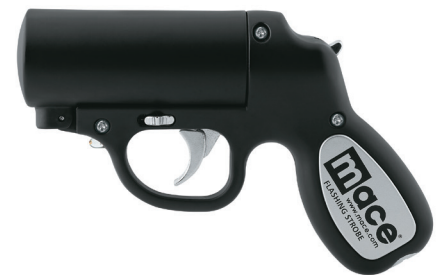
80405 • $69.95 Matte Black 6½" x 1½"

Pull the trigger once to activate the steady LED flashlight feature. Pull the trigger a second time and the pulsating LED strobe light is engaged. Available in a variety of colors, Pepper Guns are easy to reload with prefilled replacement cartridges and each gun includes (1) Water Practice cartridge (1) OC Pepper Spray cartridge and battery for LED light models. You can safely DEFEND YOURSELF in a threatening situation with the effective power of Mace Maximum Strength formula... 10% OC Pepper with invisible UV marking dye that can help police identify your attacker. Just spray and get away!