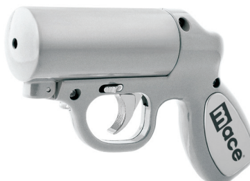
80403 • $69.95 Silver 6½" x 1½"