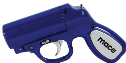
80402 • $69.95 Sky Blue 6½" x 1½"

MACE® PEPPER GUN™ Uses Advanced Delivery System utilizing Bag-in-a-Can™ Technology. This new system allows the pepper spray to spray like an aerosol in a continuous fashion from any angle, even when Pepper Gun is held upside down. Trigger Activated LED Light allows for better aim and temporarily disorients intruder. The MACE® PEPPER GUN™ Sprays up to 25 feet, and holds an OC cartridge that contains up to seven 25 foot blasts, cartridges are 28 grams.