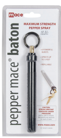
80335 • $35.95 Black 5¾" x ¾"