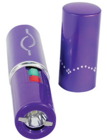
SM-LIPSTICK-PUR $22.95 Purple