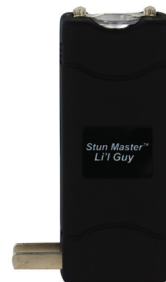
SM-LILGUY-B $24.95 Blue