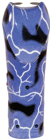
SM-FLR-BL • $22.95 Blue Lightning Print