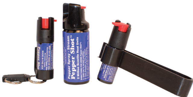
PS-6 • $19.95

PEPPER SHOT TRI-PACK You get Total Pepper Protection with this handy collection of 3 pepper sprays at one low price. A 2 ounce pepper spray for home use, a 1/2 ounce auto visor clip to keep in your vehicle, and a 1/2 ounce pepper spray with a Quick Key Release key chain.