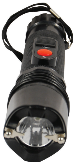
SM-FL • $27.95

This rechargeable stun gun flashlight is made from a strong ABS plastic and a high technology polymer coating. This gives the flashlight stun gun a very solid construction. Not only is it tough but it has a high voltage stun gun that will have any attacker begging for mercy. The FREE nylon holster can easily attach to a belt. The unit comes with a recharging cord, safety wrist strap and an ON/OFF safety switch.