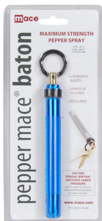
80335 • $35.95 Blue 5¾" x ¾"

Refill for The MACE PEPPER BATON. Pepper Mace fogger sprays up to 5 feet. Four gram unit contains 3 one second bursts.