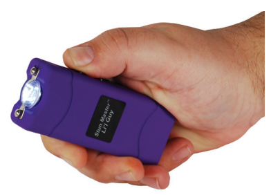
SM-LILGUY-PUR $24.95 Purple