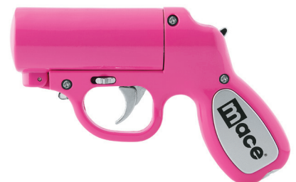
80404 • $69.95 Pink 6½" x 1½"