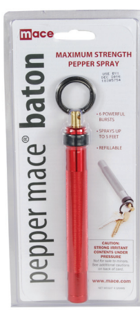
80335 • $35.95 Red 5¾" x ¾"