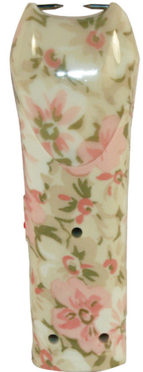
SM-FLR-FW • $22.95 Flower Print