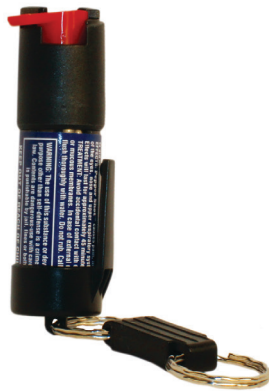
PS-2 • $8.95